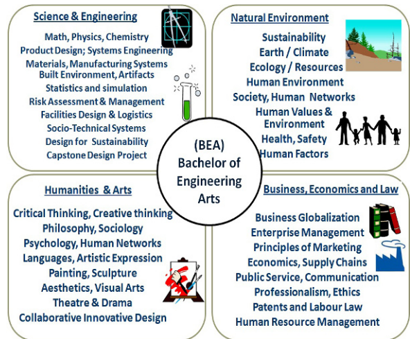
Figure 2 Structure of the BEA-ME Program