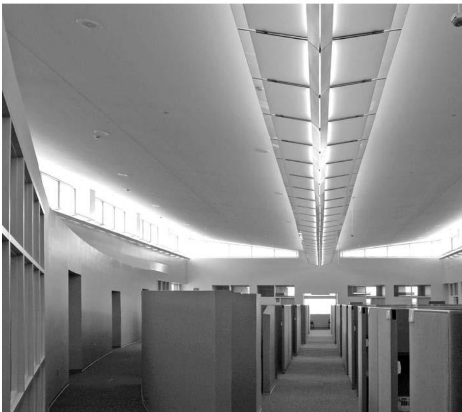
Figure 4. S&TF interior office area

and Acceptance, and Warranty. Commissioning at the Construction and Acceptance phase includes startup and testing of selected equipment. For the Warranty phase, it includes coordinating required seasonal or deferred testing and performance evaluations and reviewing the building 10 months after occupancy.