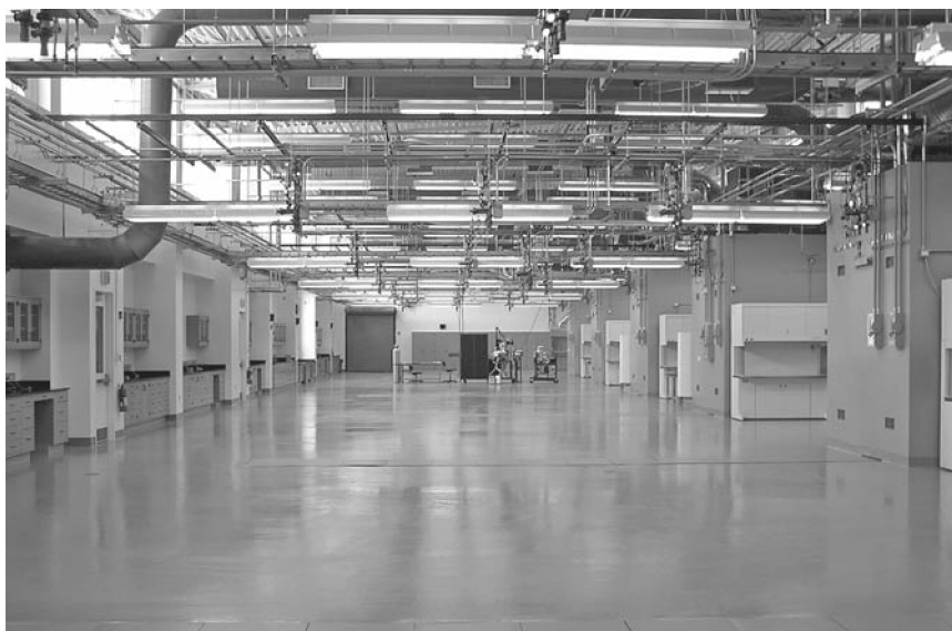
Figure 1. Interior of the PDIL