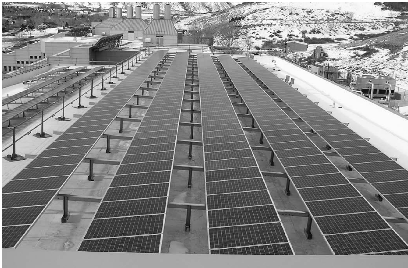
Figure 3. S&TF PV system looking west with the NREL SERF laboratory building in the background.